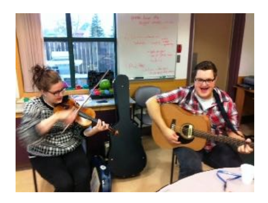
"Every time I hear you play my blood pressure goes down."

As each of our musicians will attest, the addition of music to a hospital or long term care truly changes the environment and makes residents and staff's experience so much better. All have described that the experience has left them enriched, and often forever changed.