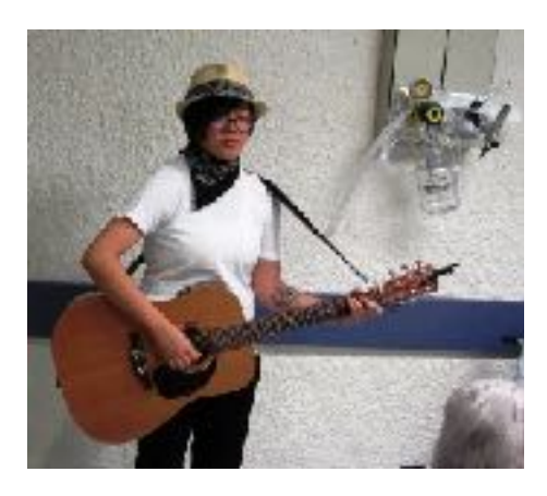
Service Canada Student Summer Jobs

Every year, we receive funding from the Service Canada Student Summer Jobs Program, to offer employment to student musicians with funding from the Government of Canada. As part of Music to My Ears, they are an integral component of our program.